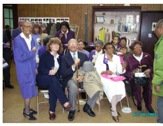
Women's Day fellowship after worship service