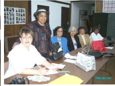
Flower Club at work on Easter Lily project