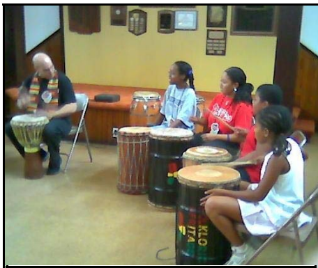
Children learn African drumming at VBS